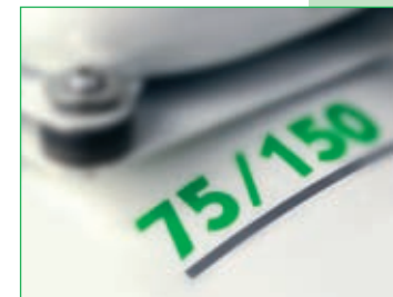
High Output T75 Pump Unit