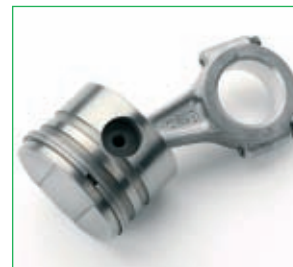
Unique Bambi Piston Rings

Above dimensions exclude wheels, when fitted +5cm to height Max Duty Cycle = 50%. Requires 20 amp single phase power supply