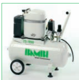
75/250 with optional wheel kit