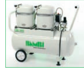
150/500 fitted with standard wheel kit supplied

Above dimensions exclude wheels, when fitted +4cm to height Max Duty Cycle = 50%. 110 volt available on request