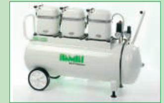
225/1000 fitted with standard wheel kit supplied