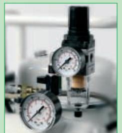
10 Micron Outlet Filter & Adjustable Pressure Regulator

Bambi compressors have been designed to maximise efficiency and ensure years of trouble free operation, which together with our comprehensive warranty extending to 5 years on the air receiver explains why so many are in use worldwide in all types of vital applications.